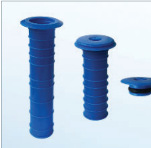
2. RH Sleeves 1.8" and 3"

When using the RH probes for in-situ testing, the ASTM standard requires testing the accuracy of the probes before reusing them. For on-site and in-office checking we offer salt solutions. We also offer to test the probes free of charge during the first year.