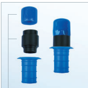
4. Top Extender for short sleeves

The RH-CC cable is a standard 3.5mm stereo cable 6ft long. One end is equipped with a sleeve-seat-plug. The plug is used to keep the probe in place while taking measurements and to un-plug the cable without having to take the probe out of the sleeve, which would disturb the acclimation.