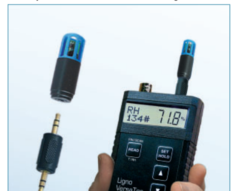
3. Using as precision thermo-hygrometer. Check EMC chart. for MC-RH relationship.