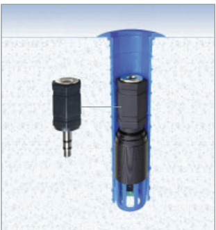
3. Depth Adapter over 2.4"

For sleeves over 2.4" deep we recommend to use Depth-Adapter to make it easier to connect the cable when the probe is further down inside the sleeve. Available as 1 unit and pack 5 units.