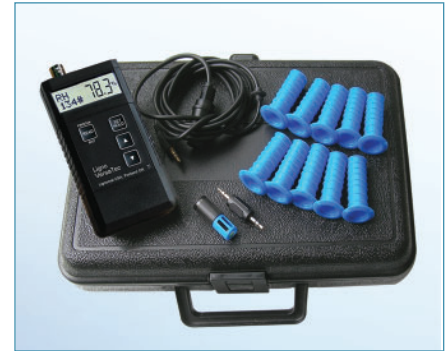
Pinless, dual-depth moisture and RH meter with accessories for in-situ concrete testing .