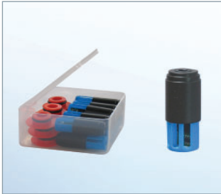
1. RH BluPeg probes