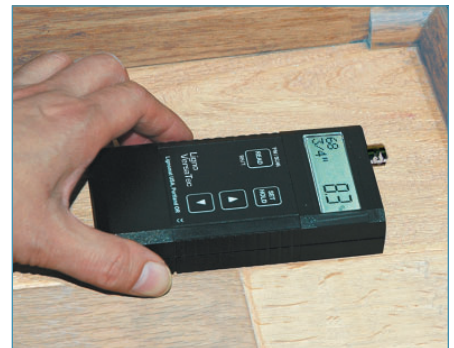
1. Using as a wood moisture meter. Can measure concrete with reference scale.