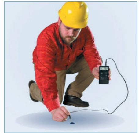
Lignomat's in-situ probe system is easy to use and easy to read with the Ligno-VersaTec. For advantages BluePeg system see page 4.