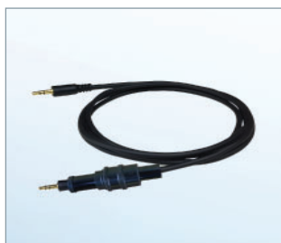
5. RH-CC cable for in-situ test

9: RH Adapter (#RH-A): Short connection between probe and meter. The RH adapter is mainly used instead of the cable, when measuring relative humidity and ambient temperatures of air.