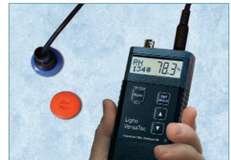
2. Concrete moisture testing with in-situ RH probes. RH-CC Cable used to read RH probe in sleeve. Easy-to-read VersaTec meter. The red caps are used to mark sleeves with probes. identify, which sleeve holds a BluePeg Probe.