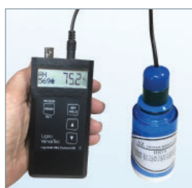
6. Salt Solution 75% Test