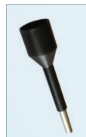
8. Vacuum Attachment