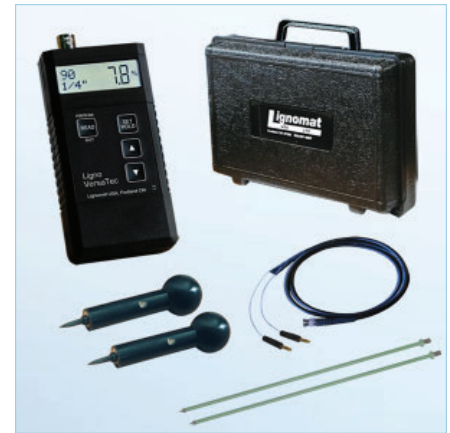
Ligno-VersaTec with multiple settings for wood and building materials.

We recommend a distance of 4" (10cm) between the pins for measuring cementitious materials including concrete. Cementitious materials have a low electrical resistance compared to wood and tend to give high values, therefore changing the distance allows a wider moisture range. Measurements obtained from concrete or cementitious materials are not true percent values. They only can be used as reference numbers or comparative readings. Comparative measurements become meaningful, when a dry sample piece of the material is available. Measurements can then be compared to the moisture value for dry.