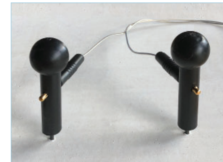
Measuring moisture in cementitious panels.