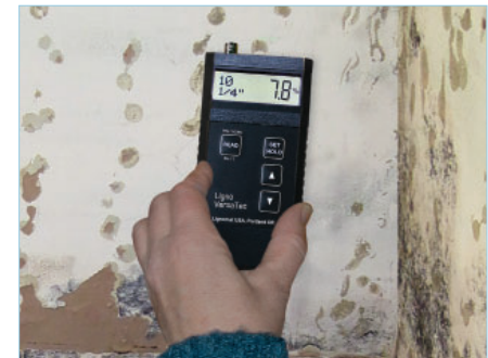
Pinless mode: fast and easy moisture checking of problem areas, photo shows moldy shower.