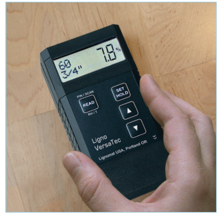
Ligno-VersaTec gives accurate moisture values corrected for wood species. Great for floors.

Display shows moisture percentage, wood species, wood temperature (only pin) and depth settings (only pinless).