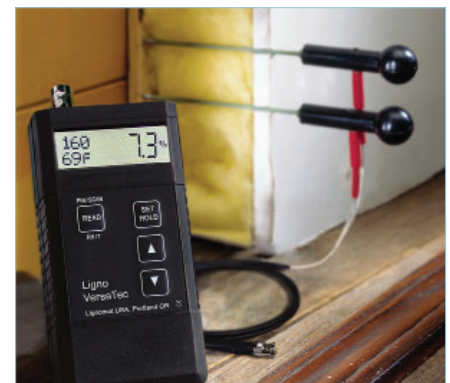
Hard-to-reach areas can be easily measured when adding the long EL pins. Reaching through insulation and wall boards.

Electrode E16 for measuring soft and hard building materials, incl. concrete.