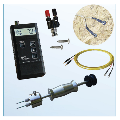
Multi-function meter with Electrode E12 for depth measurements. No matter which function you use, the Ligno-VersaTec gives superior results.

Undetected high, low or uneven moisture is often the cause for moisture problems in wood. The electrode E12 allows measuring the moisture gradient between surface and core. True moisture levels can be detected up to 2" deep, even behind wet surfaces.