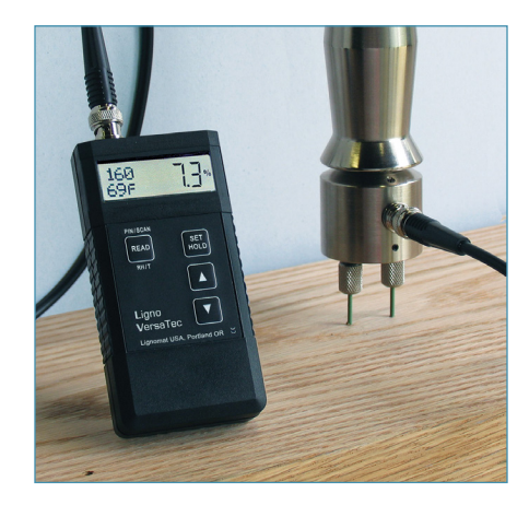
Slide-hammer to pin-point moisture distribution from surface to core. For quality control, for restoration jobs, when installing, inspecting floors.