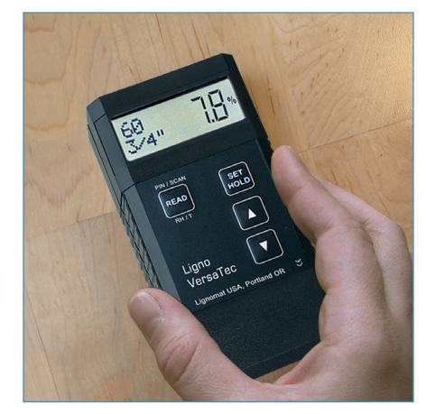
Pinless mode: fast and easy moisture checking of lumber and flat boards. Domestic and tropical woods, wood floors, engineered products, bamboo.