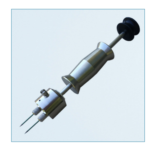
The electrode E12 has a slide hammer to insert and extract pins easily. For measurements up to 2" deep.