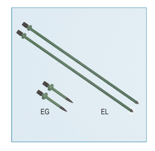
Optional EG, EL Pins can be ordered for deeper measurements.