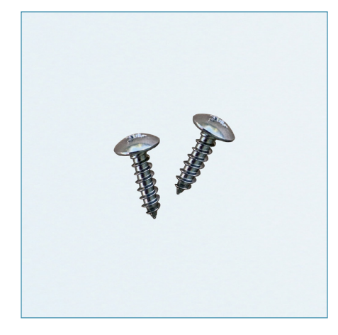
Stainless steel screws are used as probes for in-kiln monitoring