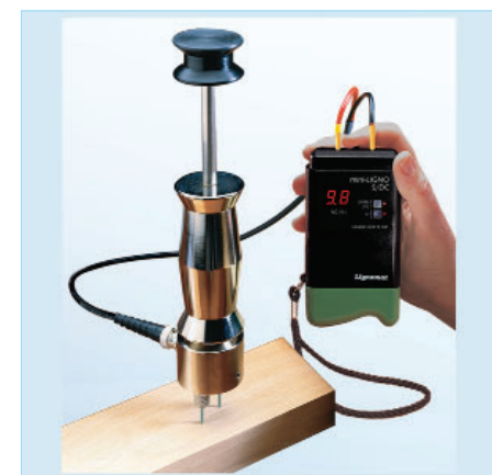
In-depth measurements detect unevenly dried wood and help avoid costly mistakes. Used when installing, inspecting floors and for restoration jobs.