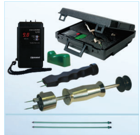
Pin meter mini-Ligno S/DC with Electrode E12 and E14-m. With the 2 electrodes you can always choose the right tool for the job to be done.

E12 pins are teflon-coated to only measure at the tip. This is important to determine if a moisture gradient exists from a dry surface towards to wet core, but it is equally important to be able to measure through a wet surface to determine how far moisture has been absorbed and at what depth the material stayed dry.