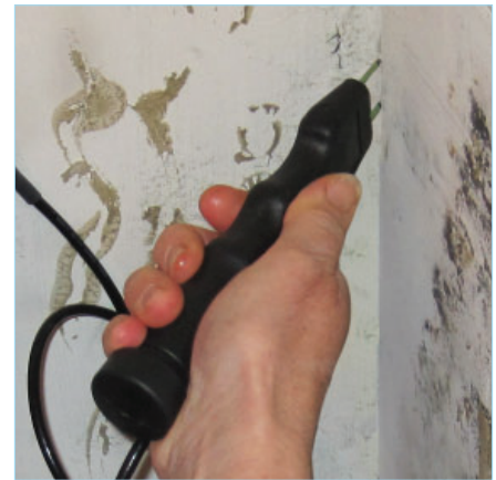
For all areas in the building envelope where the meter pins cannot reach or the display cannot be read.

1 pair DZ pins and 1 pair DA pins are included in the package. DB Pins are not included.