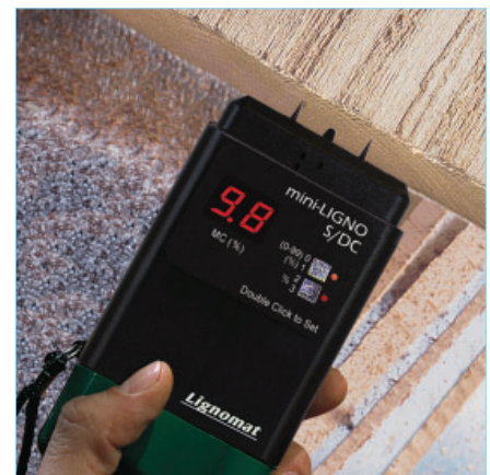
Bright LED display for optimum visibility. Display has a life-time warranty. Quality, performance and price have made mini-Lignos very popular.