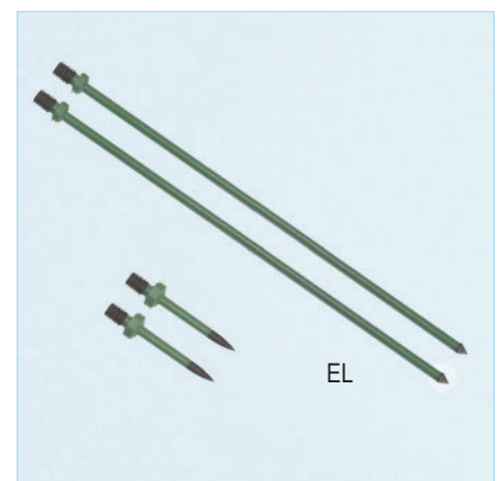
Selection of Pins for E14M: coated EG 3/4" and EL 7"

Pins for E12: DZ, DA, pins can only be used with the Electrode E12. Insulated pins measure only at the tip.