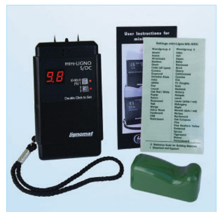
mini-Ligno S/DC meter with wrist strap in carrying pouch with belt loop, 1 9V battery 1 laminated wood group card and 1 instruction manual