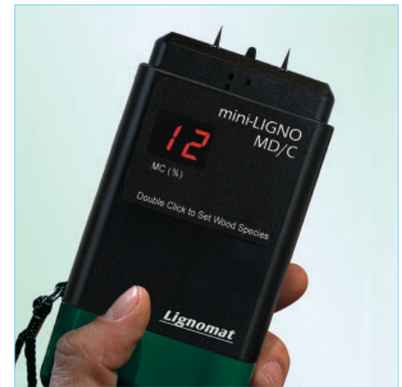
Bright LED display for optimum visibility. Display has a life-time warranty. Quality, performance and price have made mini-Lignos very popular.