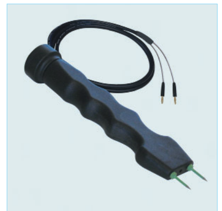
Add the electrode E14-m, the most convenient and efficient hand probe to check problem areas. Reaches into corners and can be extended to measure ceilings and carpets easily.