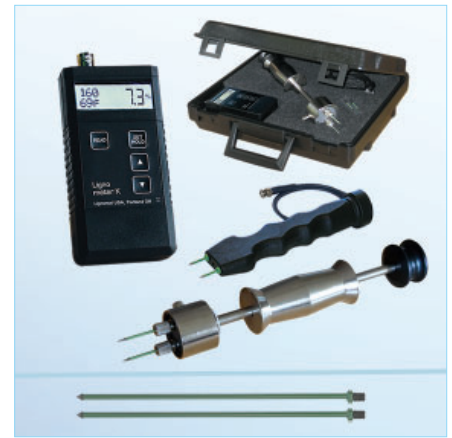
Ligno-VersaTec for pin - pinless - RH measurements.

If the round head of the E12 cannot reach the area to be measured or you need to measure deeper than 2" use the electrode E14-V and add EL pins.