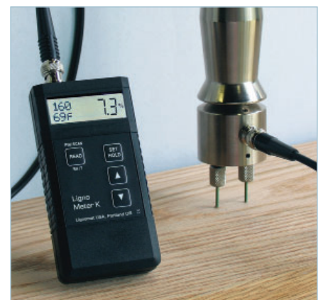
Slide-hammer to pin-point moisture distribution from surface to core.

For quality control, for restoration jobs, when installing, inspecting floors.