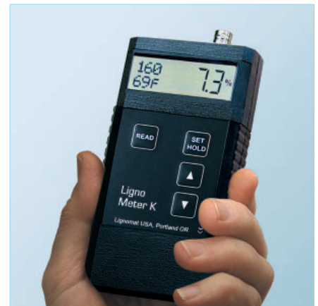
Ligno-VersaTec comes with a BNC connector for pin electrodes, a 35mm Stereo plug for RH measurements and 2 measuring plates on the back for pinless scan mode.

Display shows moisture percentage, wood species and wood temperature settings.