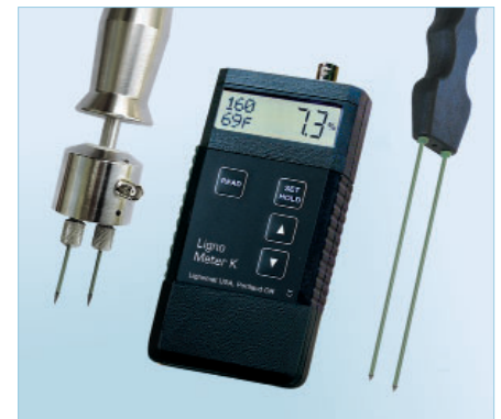
Pinless mode: fast and easy moisture checking of floors, walls and ceilings 1/4" and 3/4" deep. Domestic and tropical woods, floors, bamboo, engineered products, drywall, even concrete.

For assessing moisture problems in construction, flooring, restoration, maintenance.