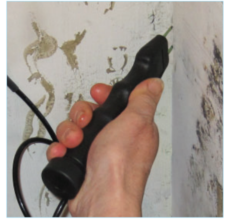
Inspector electrode E14-V measures in places where other electrodes cannot reach, with EL pins up to 7" deep.

In addition, the electrode and pins are built tough, which allows the user to hammer pins into wood and other hard materials, without damage to the probe or the pins. (Strand bamboo, hard hardwood and even cementitious materials) Pinless Search and Compare Mode can track moisture in walls, ceilings and floors. Lumber mills use the meter to make sure QC requirements are followed.