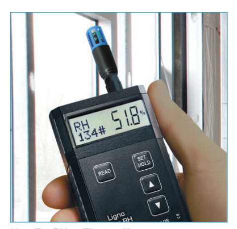
LignoTec RH as Thermo-Hygrometer