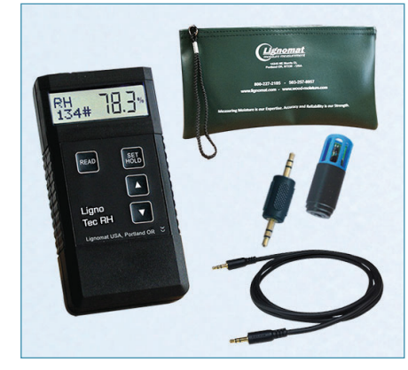
For relation between wood moisture and humidity, see EMC chart.