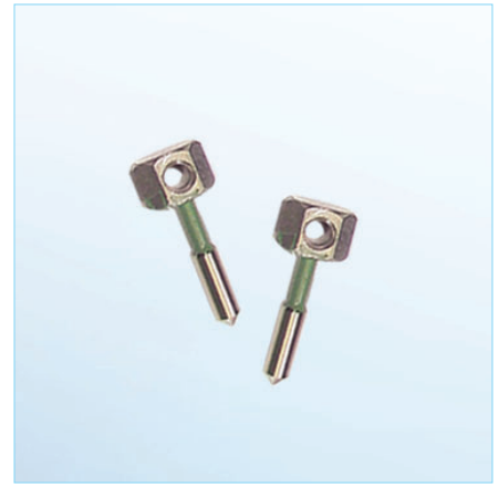
M-11 package comes with PKB probes, works for 4/4 and 6/4 lumber

1 mini-Ligno MD/C meter with wrist strap in carrying pouch with belt loop, 1 9V battery 1 laminated wood group card and 1 instruction manual 2 pair pins: 1 pair of 3/16" and 1 pair of 7/16" measuring depth (5mm, 10mm) Built in connector for an assortment of external electrodes and in-kiln probes 1 pair PKB probes 1 PK-mini cable