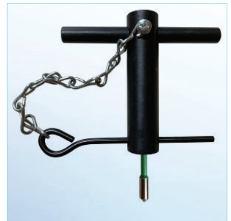
Pulling tool fits over PK probe head. Assures placement and removal without damage to the probes. Must be ordered separately.