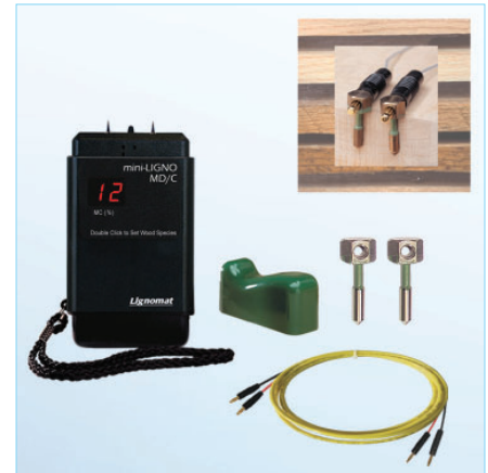
Pin meter mini-Ligno DX/C with extension cable for remote measuring. From lumber drying to monitoring critical areas in the building envelope.