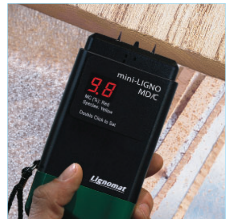
Bright LED display for optimum visibility. Display has a life-time warranty. Quality, performance and price have made mini-Lignos very popular.