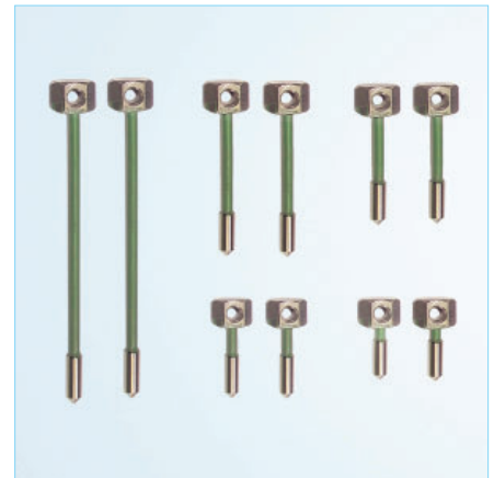
PK Probes from 1/2" to 2 3/4" measuring depth.