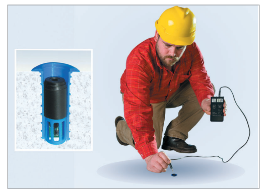
Lignomat's RH BluePeg system for in-situ RH concrete moisture testing, conforms to ASTM F2170 with reusable probes.