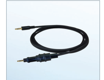
RH Cable with 3.5mm plugs with sleeve-seal for insitu concrete testing while probes are inside sleeves. #RH-CC.