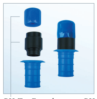
RH-Top Extenders cover RH probes in shorter sleeves. Seal-off spaces for monitoring with data loggers. #RH-EX.