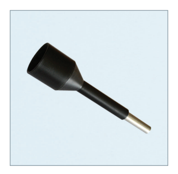
Vacuum attachment to clean holes, in-situ RH concrete moisture test. #RH-V