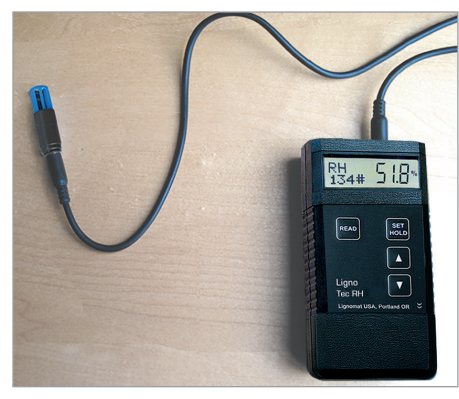
When the meter with RH adapter and probe does not reach far enough, use the RH cable for remote measurements.