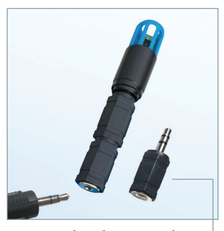
RH Depth-adapter makes RH probe longer to reach small crevices. Used for in-situ testing. #RH-DA.