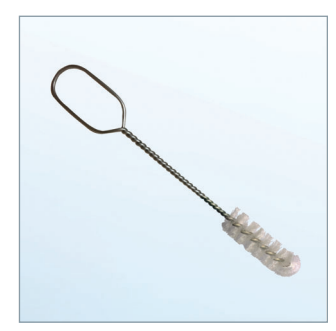
Brush to clean-out holes, in-situ RH concrete moisture test. #RH-BR