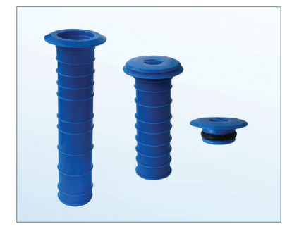
Standard sleeves 1.8". #RH-S Sleeves 3" long. #RH-SL Adjust length by cutting. For short sleeves use #RH-EX.