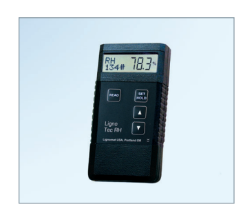
Ligno-Tec RH meter: -- RH/ T / DPT / GPP