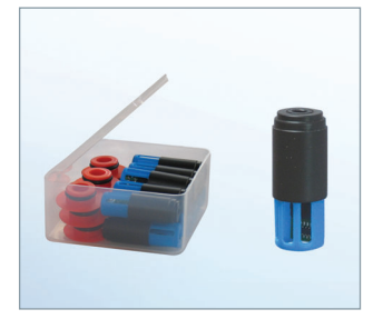
RH BluePeg probes. Sold in sets of 1, 3, 5, 10, 25. #RH-B. Comply with ASTM F2170. Re-usable in-situ RH probes.