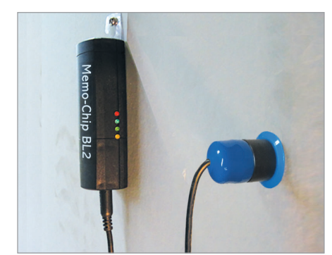
Monitor humidity changes with BL2 data logger. Measuring depth from 0.5" to 15". Opening is sealed with the RH-CB cable with sleeve-cover.