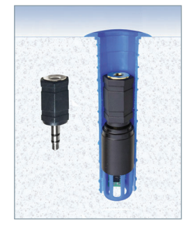
RH Depth-adapter plugs into RH probe for easy cable connection in sleeves over 2.4" long.