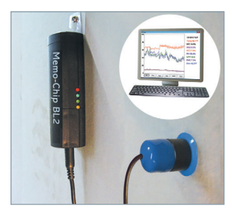
Data logger BL2 records -- RH/T/DPT/GPP/EMC Measures inside wall sealed off with cable RH-CB.