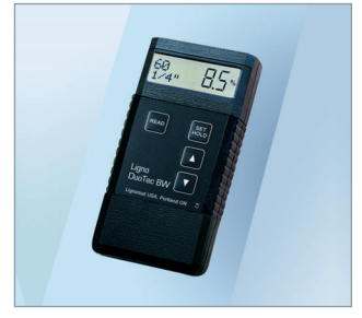
Ligno-DuoTec BW meter: -- RH/ T / DPT / GPP -- pinless, dual-depth