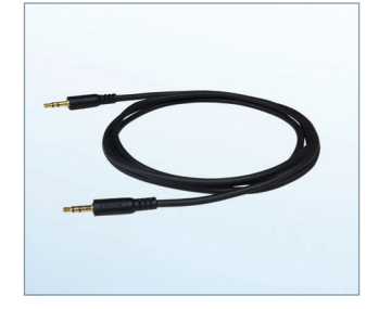
RH Cable with 3.5mm plugs. Connects meters and data loggers to RH probes. #RH-C.