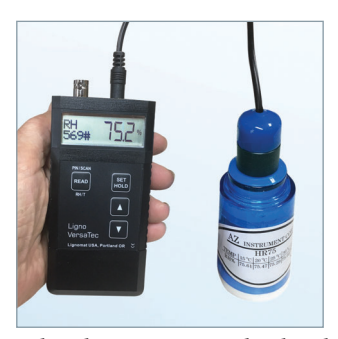
Salt solution 75% to check calibration of RH probes. Comes with cable #RH-CB and fittings for BluePeg probes. #T-75.