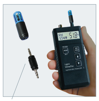
RH Adapter. Connects RH Probe directly to RH meter For Thermo-Hygrometer usage. #RH-A.