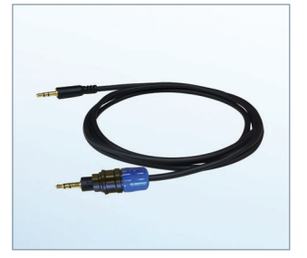
RH Cable with 3.5mm plugs with sleeve-cover to monitor RH probes. Cable stays connected. #RH-CB.