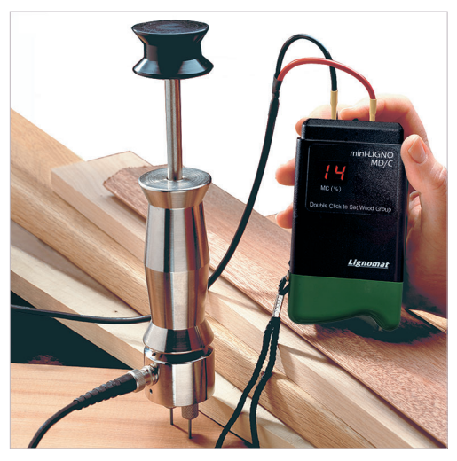
Adding depth electrode E12 with insulated pins allows measuring moisture up to 2" deep.