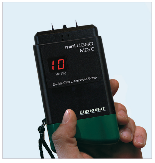
Quality, performance and price have made mini-Lignos one of our most popular moisture meters.

Specifications are subject to change without notice.